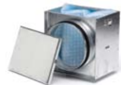
MFL Filter Box