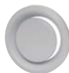
BOC/BOR Interior Air Valve